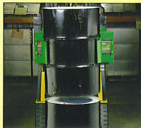
STACK DRUMS VERTICALLY

The ULTRA-GRIP is self-powered and requires two 12-volt, deep-cycle batteries with a recommended size of 12 1/4"L x 6 3/4"W x 9 5/8"H to the top of the terminal. Batteries are not included.