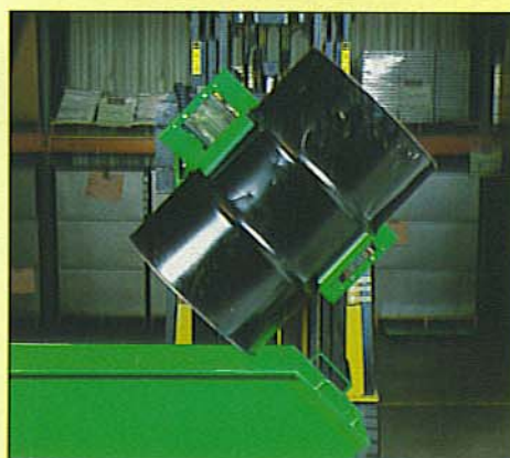
CONTROL DUMP RIGHT