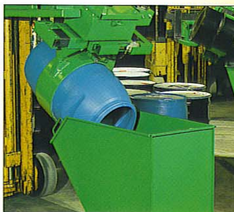
CONTROL DUMP FORWARD