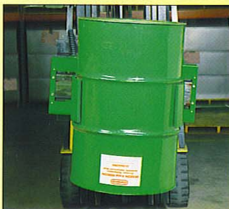
INVERT DRUMS 180°