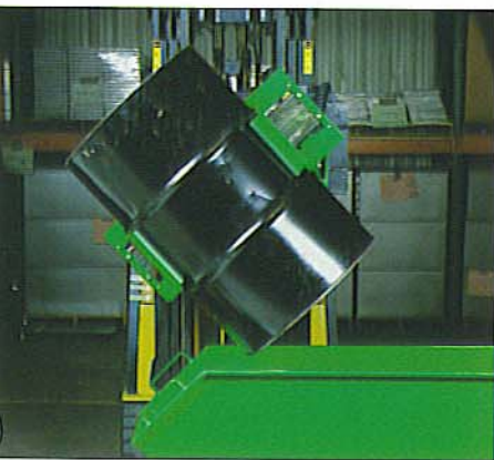
CONTROL DUMP LEFT